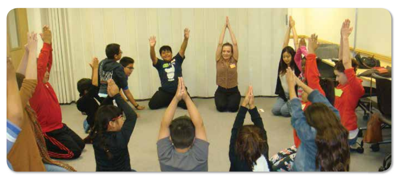
BodyWorks Program Yoga Session

Children, meanwhile, engage in experiential kinesthetic learning activities; eat whole, colorful foods; and find opportunities to move and have fun. The program provides additional support to children with special health care needs, including those with autism and intellectual disabilities, so that they can engage in all activities.