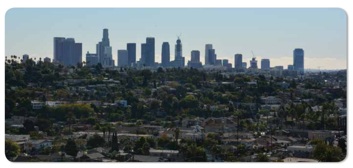
The City of Los Angeles