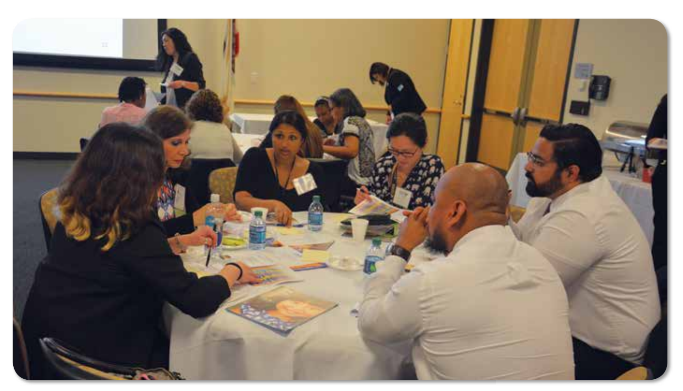
Coming together to discuss community health needs

The hospital's Community Benefit Advisory Committee, community leaders, representatives and residents participated in this process. CHLA is currently conducting the 2016 Community Health Needs Assessment and developing our FY 2016-18 Community Benefit Implementation Strategy.