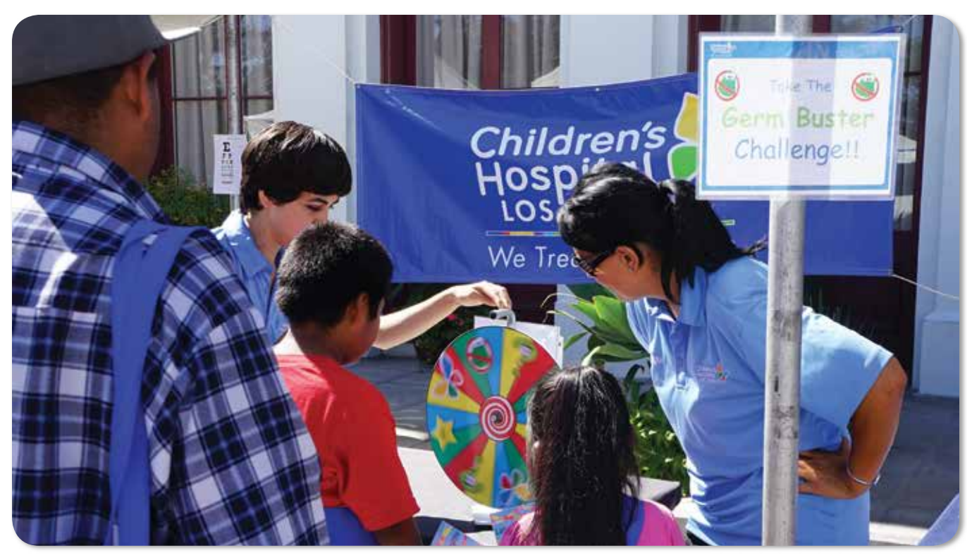
CHLA staff conducting outreach and providing education out in the community.