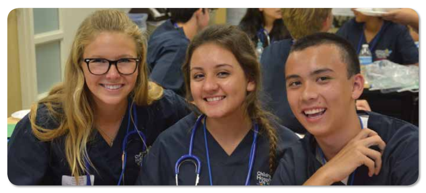
CAMP CHLA student participants