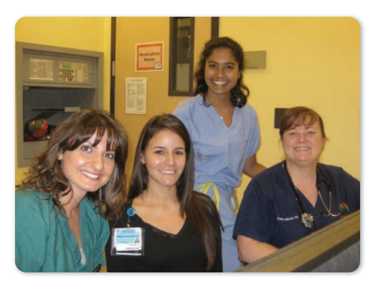
Our commitment to quality inpatient care begins with our commitment to supporting our nurses' career goals and the development of future nurses.

This track is designed for interns interested in a more in-depth and focused experience in community-based intervention or policy work. Interns on the IMPACT Project Track spend up to six weeks of their intern year working on the development of a single project. They work closely with advocacy directors and mentors to perform a needs assessment, design and implement their study or intervention, arrange meetings with key community partners and complete grant applications.