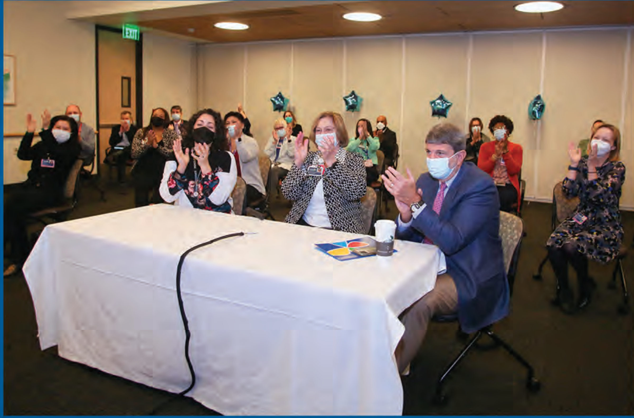
CHLA team members celebrate after learning the hospital attained Magnet designation for the fourth time.

Communications, Information Services, hospital leaders and many others to plan, schedule and execute the three-day site visit, which was conducted virtually on Webex. Dozens of laptops were configured to allow team members to gather in conference rooms to create a conversational atmosphere, connect with appraisers and be seen and heard. Equipped with rolling iPads, Magnet Champions visited every unit, clinic and work area where nursing is practiced so that appraisers could speak with clinical staff in their environments. CHLA community stakeholders—including therapy dog handlers, former patients, and community health care leaders—joined at the end of the visit to share their experiences with CHLA nurses in many different arenas.